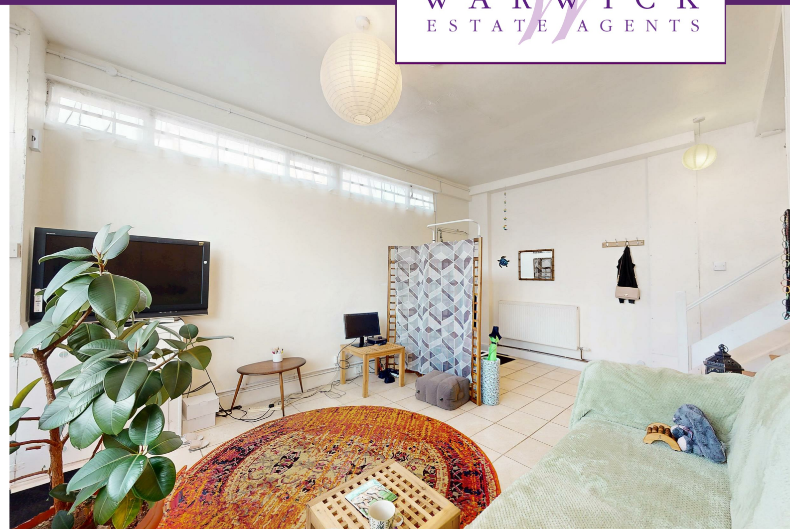
Preston Place, Willesden Green, NW2 5NX